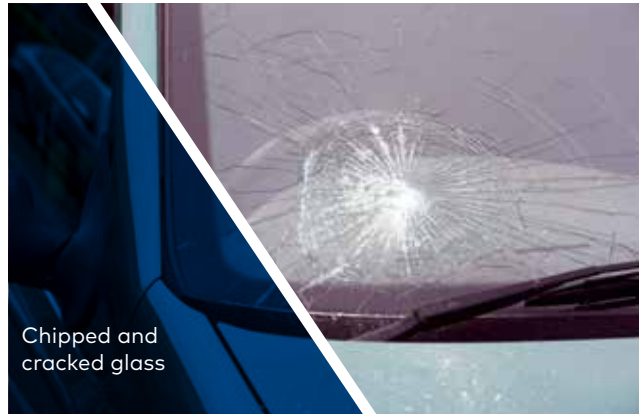
Chipped and cracked glass