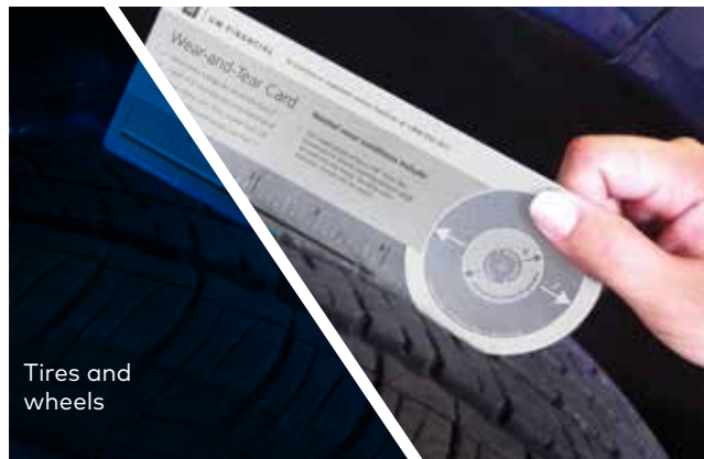
Tires and wheels