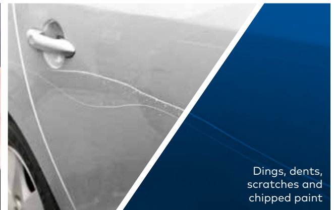
Dings, dents, scratches and chipped paint