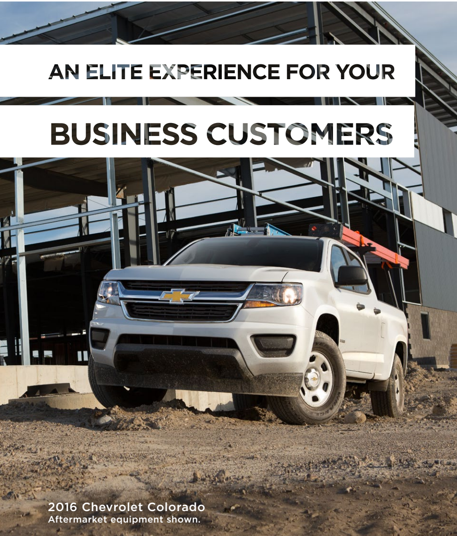
2016 Chevrolet Colorado Aftermarket equipment shown.